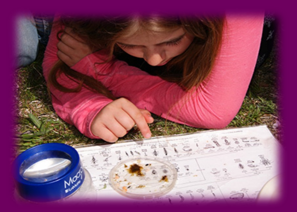
May 2017 photo shows a student using a dichotomus key to identify aquatic macroinvertebrates.

Through MSU Extension 167 NE Michigan teachers were directly supported through professional development activities to help them to implement PBSE as part of their education plans. Eight local Alcona educators participated.